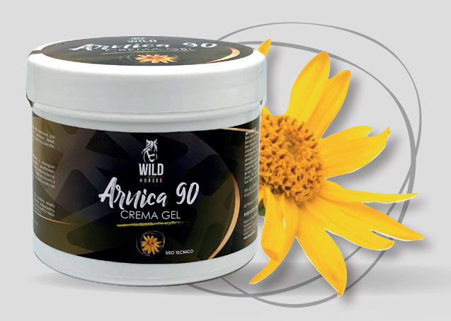
WILD HORSES ARNICA 90 500G/1KG