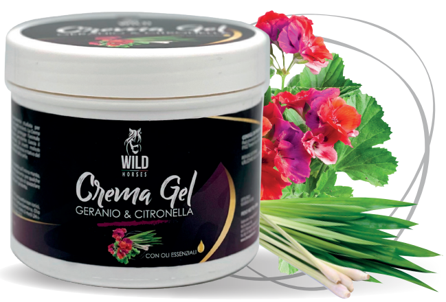
WILD HORSES GERANIUM & CITRONELLA GEL CREAM 500G / 1KG