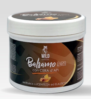
WILD HORSES BEESWAX BALM FOR LEATHER & SKIN 500G / 1KG/ 5KG