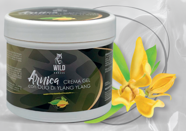
WILD HORSES ARNICA + YLANG YLANG 500G