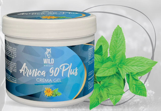
WILD HORSES ARNICA 90 PLUS + MINT 500G