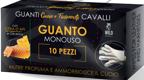
WILD HORSES DISPOSABLE LEATHER GLOVE AND HARNESSES CERA D'API 10PZ