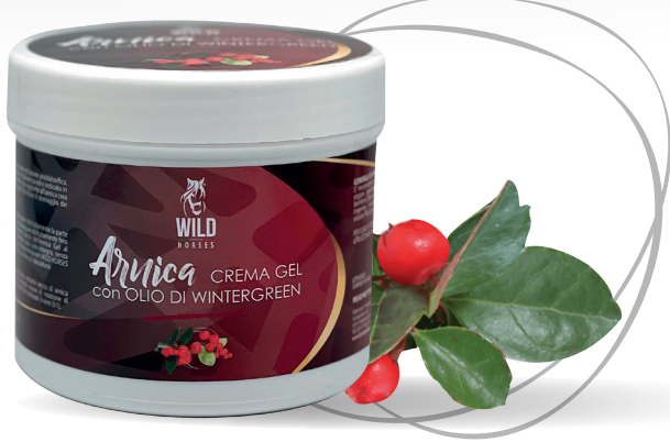
WILD HORSES ARNICA + WINTERGREEN 500G