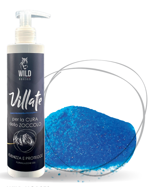
WILD HORSES GEL VILLATE 250ML / 500ML / 1LT