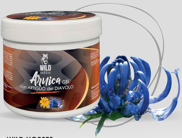
WILD HORSES ARNICA + DEVIL'S CLAW 500G/1KG