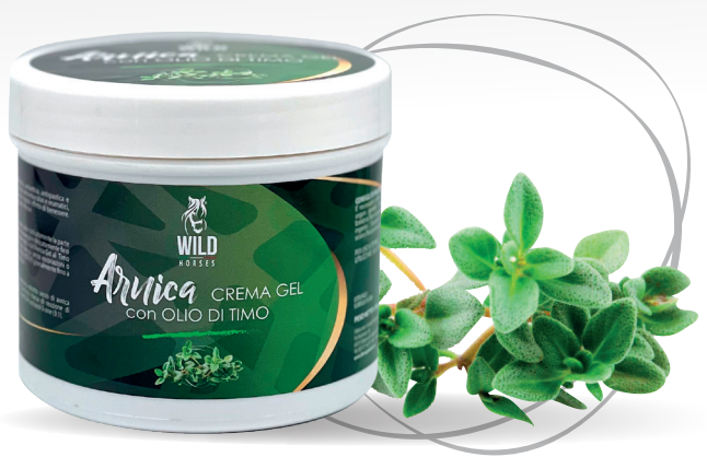
WILD HORSES ARNICA + THYME 500G