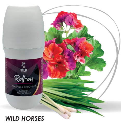
WILD HORSES ROLL-ON GERANIUM & CITRONELLA 50 ML